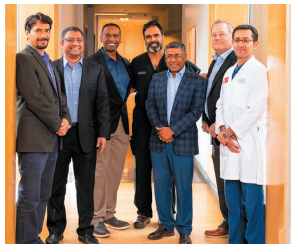
HDNM and RMA have made substantial contributions to Presbyterian Healthcare Foundation and are the largest single contributor to Presbyterian Community Health.