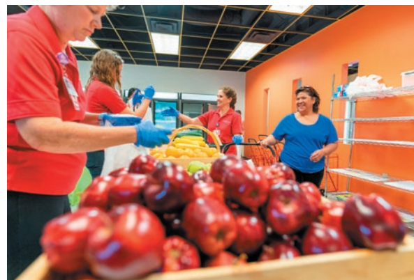
At the Food Farmacy, located in the new Presbyterian Community Health Resource Center, qualified patients can select a variety of fresh foods and healthy pantry items for free.